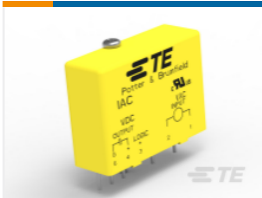
TE Part # CAT-P851-IA1 SSR PCB Mount, Slim Relays